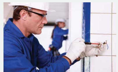
for the Engineer